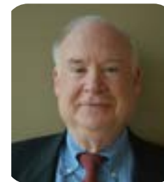
Malcolm Mitchell Chair

So, come and visit, become a volunteer, participate in an educational program, or just walk the trails and relax in our 127 acres of nature. Thank you for making 2018 another banner year of building community.